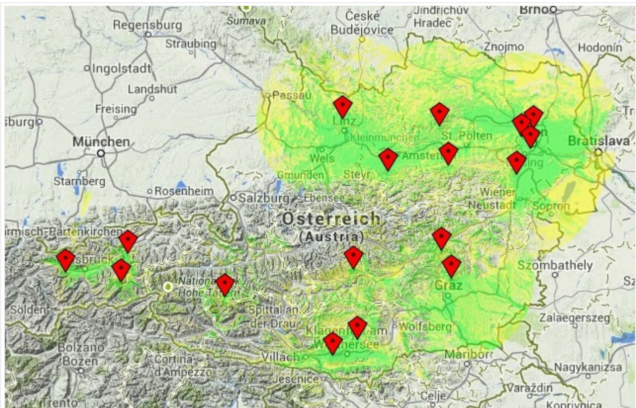
Darstellung der Motorola DMR Abdeckung in Österreich auf TG232