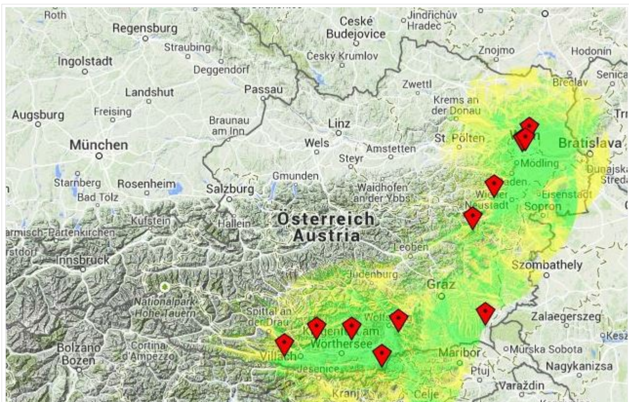
Darstellung der Hytera DMR Abdeckung in Österreich auf TG232